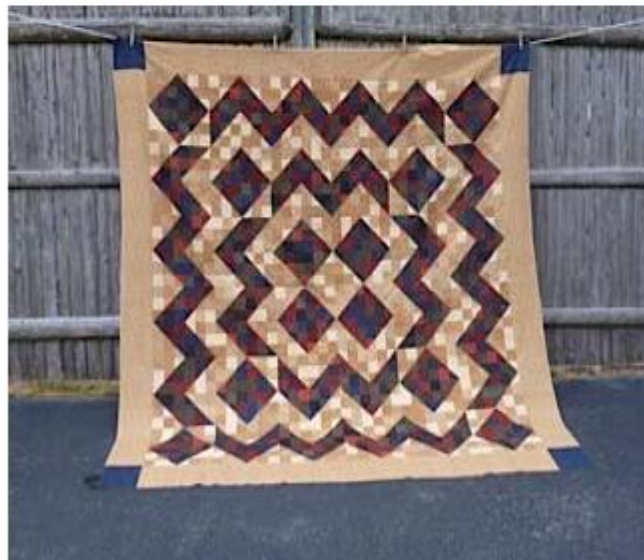
Tickets $1 each or a book of 6 for $5