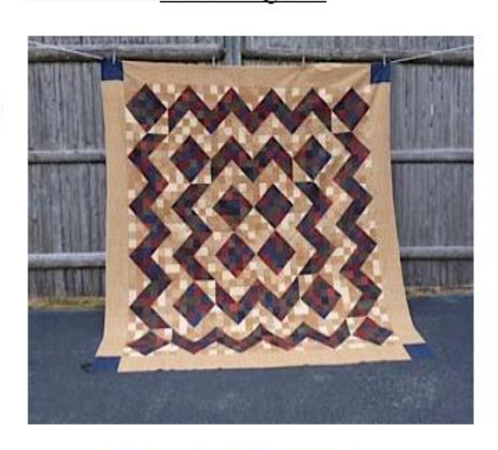
Tickets $1 each or a book of 6 for $5