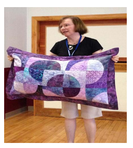
Page 4 of 11